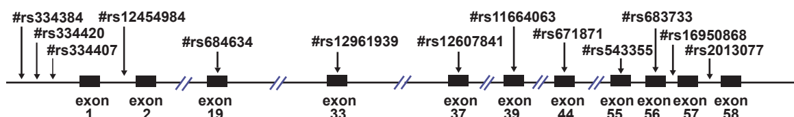
Figure 1 13 SNPs analyzed in the LAMA1 gene. Vertical arrows show the 13 SNPs analyzed in this study with the #rs numbers. Left of the figure is 5' UTR. Black boxes show the translated regions (exons) of this gene with the exon numbers below them.

We screened 13 SNPs within the the LAMA1 gene for all the cases and controls (Figure 1). Seven SNPs localized in the