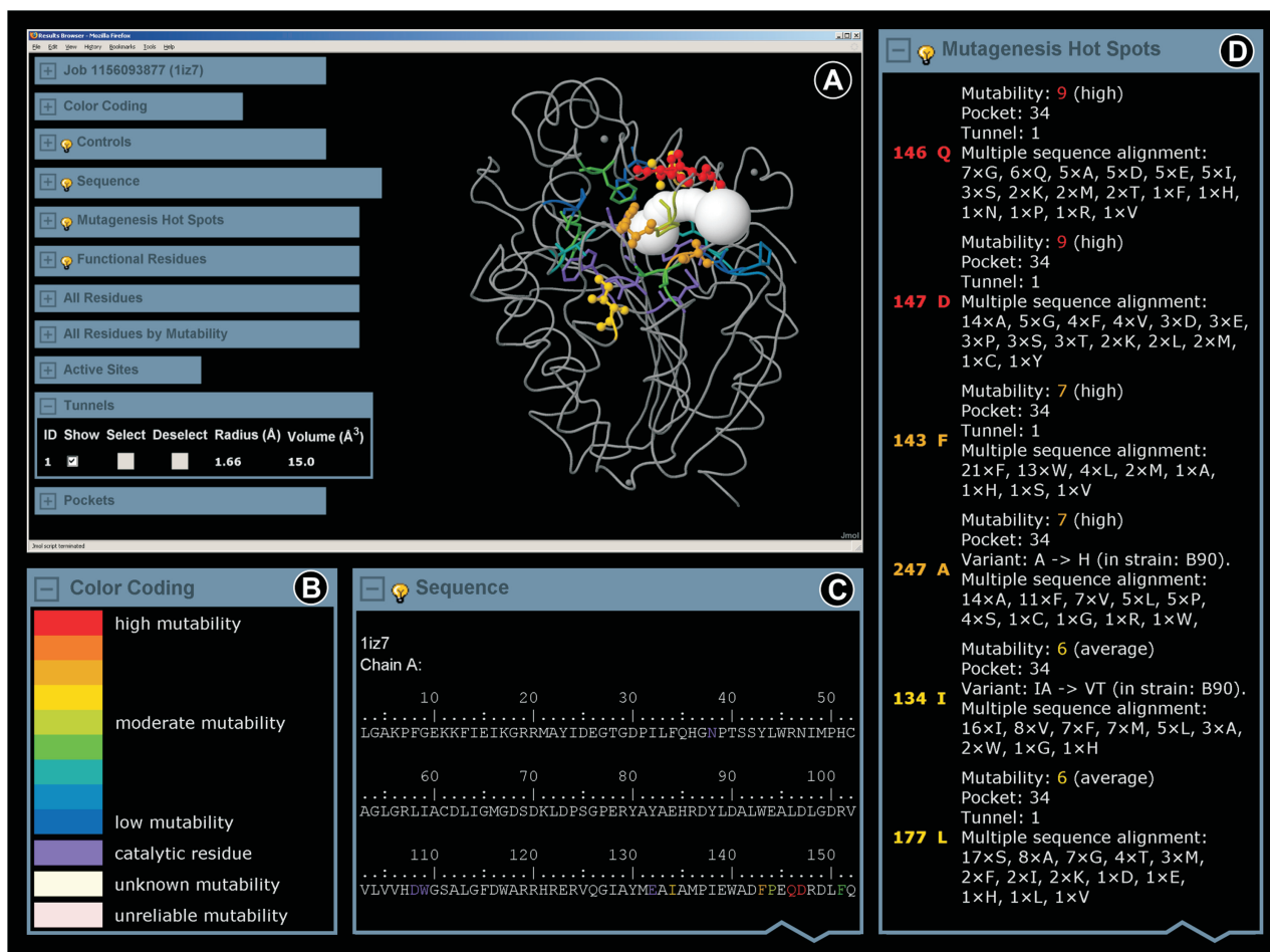
Figure 2. Graphic interface of the HotSpot Wizard results. (A) The ‘Results Browser’ includes the embedded Jmol applet enabling visualization of the annotated structure, ligands and identified tunnels. ‘Hot spots’ and functional residues are highlighted and colored according to their estimated mutability. The ‘Results Browser’ further offers the ‘Job’ panel enabling navigation through the results, ‘Control’ panel providing basic operations for manipulating the structure, annotated sequence and summary tables of ‘hot spots’, functional residues, all residues, active sites, pockets and tunnels. (B) The mutability color scale is defined in the ‘Color coding’ panel. (C) The ‘Sequence’ panel is interactively interconnected with all other sections of the ‘Results Browser’. (D) The output is summarized in the ‘Mutagenesis Hot Spots’ table listing all identified ‘hot spots’ ordered by their mutability. For individual residues, information about their mutability, structural location, functional role and annotations are provided.

assignment of the catalytic residues. Information about the catalytic residues is used to avoid mutagenesis at the residues critical for the enzyme function, but also for the assignment of the active site pocket and the starting point for the calculation of tunnels. If catalytic residues are not found in databases either for the query sequence or for homologous sequences, users must specify this information manually. Otherwise, the pocket with the largest volume will be assumed to contain the active site and no tunnels will be computed. (ii) The identification of the active site pocket is another critical step of the computation. Surface residues can be incorrectly assigned as part of the active site pocket. This sometimes happens at the interface of two subunits forming a very large pocket. Exclusion of one of the chains is a simple solution to this problem. Miss-assignment of the residues of the active site pocket happens also for proteins carrying large open depressions at the protein surface, which has to be recognized by the user, and these residues should not be considered for mutagenesis experiments. (iii) Finally,