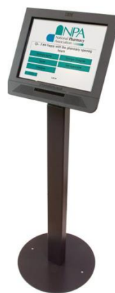
Figure 6. Touchscreen kiosk used for consumer feedback (from http://www.crtsolutions.co.uk/index.php?pageid=15 ).

Patient registration and clinic organisation: An increasing use is for patient registration and to improve the flow of patients through a clinic or general practice. For example, the EMIS general practice system (which has about half the English market) has offered a patient registration kiosk since