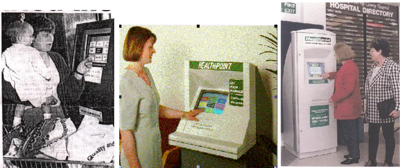
Figure 3. Healthpoint in (from left) Maryhill Shopping Centre Glasgow 1991, 1994, and in a Surrey Hospital 1996.