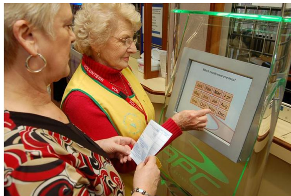
Figure 10. E-reception at Sherwood Forest Hospitals [109].

In December 2008, a press report [137] described a similar approach at University Hospitals Birmingham NHS Foundation Trust. Self-service kiosks have been installed in the reception areas of a new hospital build to streamline reception and registration processes, using technology that integrated with its patient administration system. A fully operational kiosk was trialled in Selly Oak hospital for two months, with its supporting system running from the trust's IT data centre. It proved popular with patients, 51% of whom opted to use it, and improved the efficiency of receptionists. It also improved data quality. If a patient's details are not correct on the kiosk, they are referred to a receptionist, who can make changes on the core PAS system. The new hospital is due to open in July 2010.