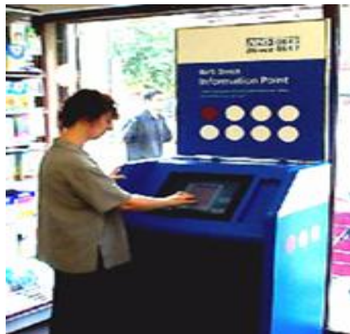
Figure 5. NHS Kiosk, 2001.

Jones [75] carried out a study of NHS kiosks in 2001. Automatic monitoring statistics were produced for all 136 kiosks for four months showing number of user episodes. A sample of twenty kiosks representative of type of site and geographical location was taken for an ‘exit poll’ and geographically defined postal survey. A total of 1,666 people were interviewed leaving nineteen sites. (One site was unable to participate in interviews.) Postal questionnaires were sent to 1,400 randomly selected households living within five kilometres of the twenty kiosks. Kiosk sites and respondents to the postal survey were classified by deprivation category. All 1,652,586 English postcodes were ranked according to an index of multiple deprivation and postcode areas then classified according to their decile of deprivation.