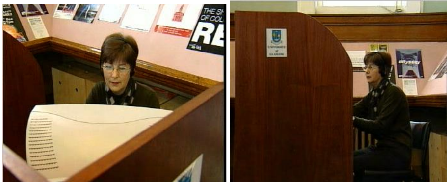
Figure 7. Booth in Whiteinch public library Glasgow (1998) with multimedia touch screen system for cognitive behavioural therapy for stress.

The Wellpoint kiosk that includes various patient measures could be compared with any occupational nurse time saved, or possibly in terms of a greater take up of a service amongst hard to reach groups.