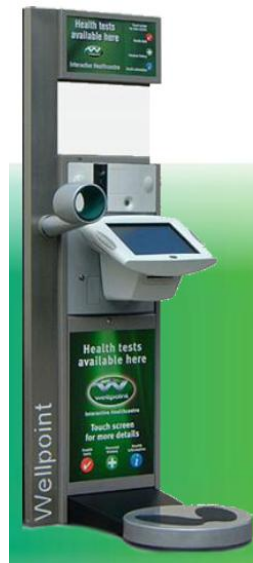
Figure 8. Wellpoint kiosk.

Other widely available kiosks in UK: StartHere is a charity that supplies a kiosk not restricted to, but including, health information to health but ‘cover the range of social issues for which an individual might need support across the whole social spectrum including health, housing, education, employment, benefits and welfare issues’. They have a demonstration of a kiosk interface for StartHere East London at http://www.starthere.org/demo/kiosk/Html/index%2002.htm .