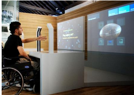
Figure 9. Display at National Waterfront Museum.

It senses movements as they use their hands to navigate their way through the depths of the exhibit touching everything in virtual reality.”