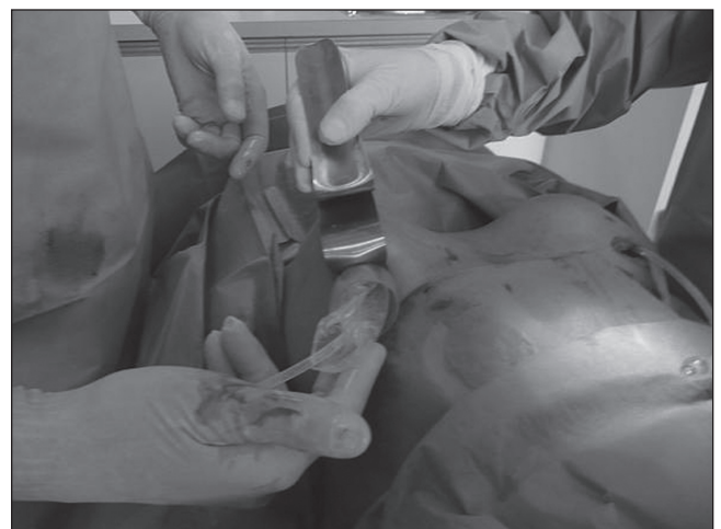
Figure 3) The prosthesis is passed as a folded tube through the lumen of the shorter casing into the pocket, preventing any elements of contact between the prosthesis and the skin