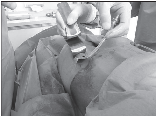
Figure 4) The prosthesis is completely within the pocket after passing through the lumen of the shorter casing

This device has many advantages over the anoscope because it transmits far more light, and its diameter fits into a 4.5 cm incision, which is quite acceptable for inframammary incisions. Its length can be determined by the surgeon's preference. The