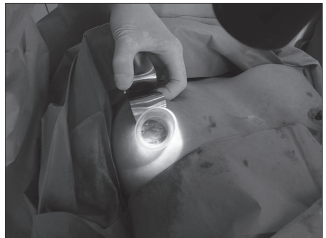
Figure 2) After the tip has been heat burnished it becomes translucent, transmitting light with enhanced intensity

Once hemostasis is complete, the prosthesis, partially filled with 30 mL of normal saline, is simply folded and lubricated with Bacitracin (Pfizer Canada Inc) or saline (Figures 3 and 4). It is passed as a folded tube through the lumen of the shorter casing into the pocket. This is atraumatic for the prosthesis, and completely prevents any elements of contact between the prosthesis and the skin. We have used implants as large as 400 mL that, when filled with 30 mL of saline, can simply be folded and passed through without difficulty.