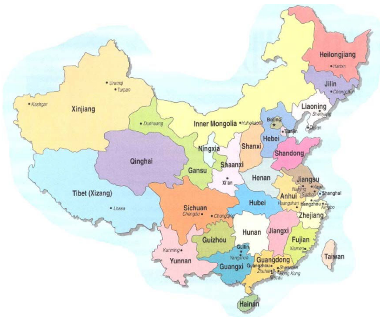
Figure 1 The provinces and the major cities of PR China.

1992) to 83% (in 1993 – 1994); and the 'full breastfeeding' rate increased from 28% before the initiation to 40% afterwards (the cross sectional study, n = 439 ) [7]. Another survey in Beijing (retrospective study, n = 817 ) showed the breastfeeding rate at four months was only 16.42% in 1989 – 1991; but it increased to 56.73% in 1995 – 1997 [23]. A survey at the Beijing Railway Hospital (retrospective study, n = 824 ) showed the same trend: the breastfeeding rate at four months was 16.77% in 1991 – 1994 and 58.77% in 1995 – 1998 [24].