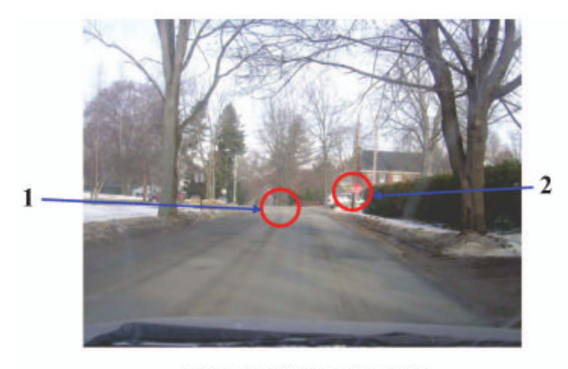
(d) 1 = crosswalk; 2 = cross traffic