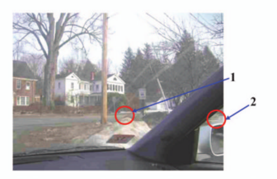
(h) 1 = right side view - cross traffic; 2 = right side view - pedestrians and/or bicycles