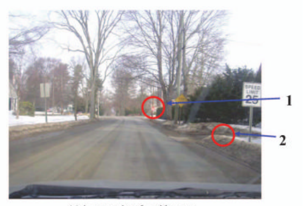
(c) 1 = stop sign; 2 = side street