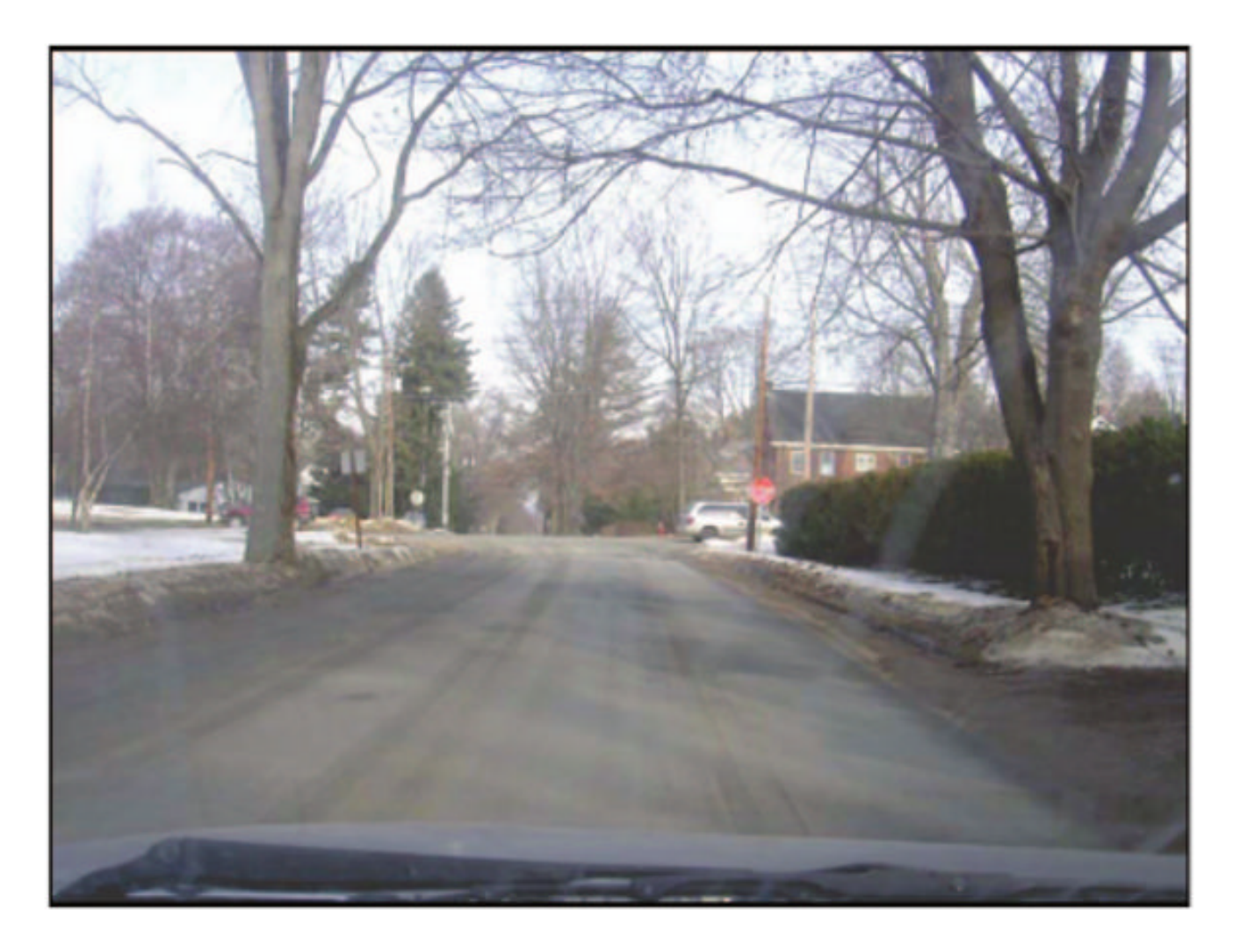
Figure 2. Hidden sidewalk perspective view.