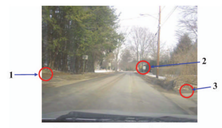
(a) 1 = driveway; 2 = regulatory sign; 3 = driveway