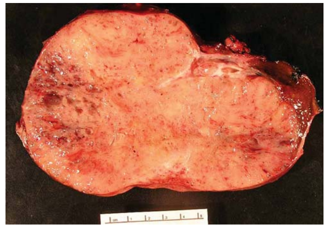
Figure 3 Cut surface of the resection specimen shows a tan-gray, rubbery, firm well-demarcated tumor with multifocal areas of hemorrhage and a thrombus at the right upper portion of the specimen. The scale shows centimeters.

abdomen, pelvis, and chest. She is alive without recurrence 36 months after surgery.