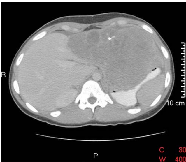
Figure 1 Post-contrast axial CT demonstrates a heterogeneous mass replacing the left lobe of the liver, hypoenhancing to liver parenchyma, with areas of calcification. It displaces the stomach posteriorly and inferiorly. The left portal vein is not visualized.

The patient received adjuvant chemotherapy with ifosfamide and mesna at 14 \text{ g/m}^2 for two courses followed by cisplatin at 100 \text{ mg/m}^2 with doxorubicin at 75 \text{ mg/m}^2 . Chemotherapy courses were administered at 3-week intervals. She received a total of four courses of ifosfamide and two courses of cisplatin and doxorubicin with a cumulative dose of doxorubicin of 150 \text{ mg/m}^2 . The patient has been followed clinically as well as by serial CT imaging of her