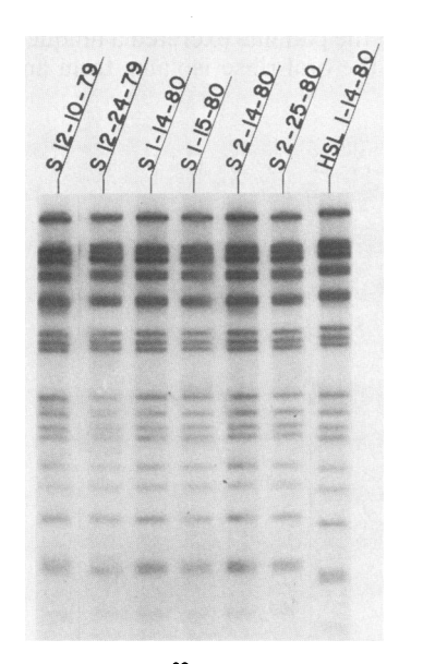
FIG. 3. Autoradiogram of [^{32}P]DNA from six oral rinse isolates (S) and one herpes labialis isolate (HSL) from patient A after digestion with KpnI restriction endonuclease and electrophoresis in a 1% agarose gel. Numbers refer to the date of each isolation.

The present study identified a significantly increased rate of HSV excretion during the time of an episode of herpes labialis (11 of 57 [19%]). This rate is comparable to that described by Douglas and Couch (24.1%). Lower values of 8 and 7% obtained in two additional studies can probably be attributed to the use of swab samples of saliva for virus isolation (1, 20). Virus excretion was uncommon in the week before an episode of herpes labialis (1 of 45 [2.2%]). These data showed that oral HSV excretion was not antecedent