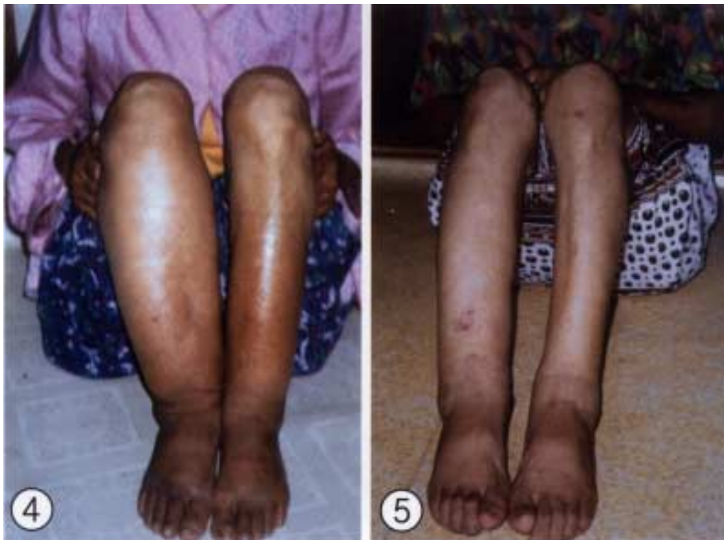
Figs. 4-5. Elephantiasis of lower legs in the patients residing on Daeheugsan-do. Fig. 4. Bilateral elephantiasis of lower legs in a 70-year-old woman. She had a history of swollen legs for over 25 years. Fig. 5. Bilateral elephantiasis of the lower legs in a 67-year-old woman, who has suffered from the disease for 20 years.

We tried a new treatment regimen for lymphatic filariasis, Wuchereria bancrofti infection (Dunyo et al., 2000a & b), a combination of albendazole (400 mg) and ivermectin (150 \mu g/kg) in a single dose; this also appeared to be effective against B. malayi infections, with the exception of one case. It is regretful that the number of subjects in the present study was too