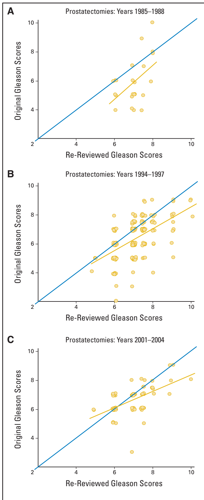
Fig 1. Comparison of standardized and original Gleason scores assigned to prostatectomy specimens during three time periods. The Gleason scores and the best fitting line through the points are plotted in gold. The blue line represents perfect concordance between original and standardized scores.

14.0 for GS 2 to 5, 8.5 for GS 6, 10.8 for GS 3 + 4, 45.2 for GS 4 + 3, 26.6 for GS 8, and 15.9 for GS 9 to 10.