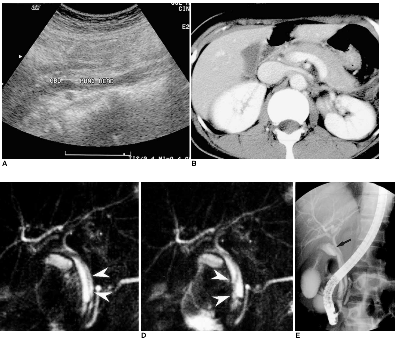
Fig. 2. Biliary ascariasis in a 41-year-old woman.

If biliary ascariasis is suspected, US is the imaging modality of choice. The US findings of biliary ascariasis have been previously described: tubular, echogenic, non-shadowing structures, sometimes with a thin, longitudinal, central sonolucent line (2-4, 6, 8). Unless the operator carefully examines the biliary tract, however, the diagnosis of biliary ascariasis is difficult and in this respect, endoscopic retrograde cholangiography is a good but relatively invasive