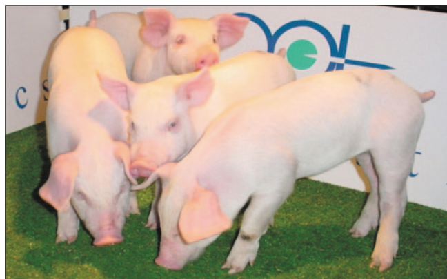
Figure 3: Gal-knockout pigs

With xenotransplantation, there is a risk of transmitting infectious agents from animal to man. With regard to most microbiological agents, the risk can be minimized by using animals from strictly controlled herds. However, such measures will not affect the porcine endogenous retrovirus (PERV). These viruses are a permanent part of the genome in all mammalian species [12] and so all recipients of porcine transplant will inevitably be exposed to PERV. However, the endogenous retroviruses do not replicate or cause disease under physiological conditions. However, in the late 1990s it was found that when pig cells were co-cultured with