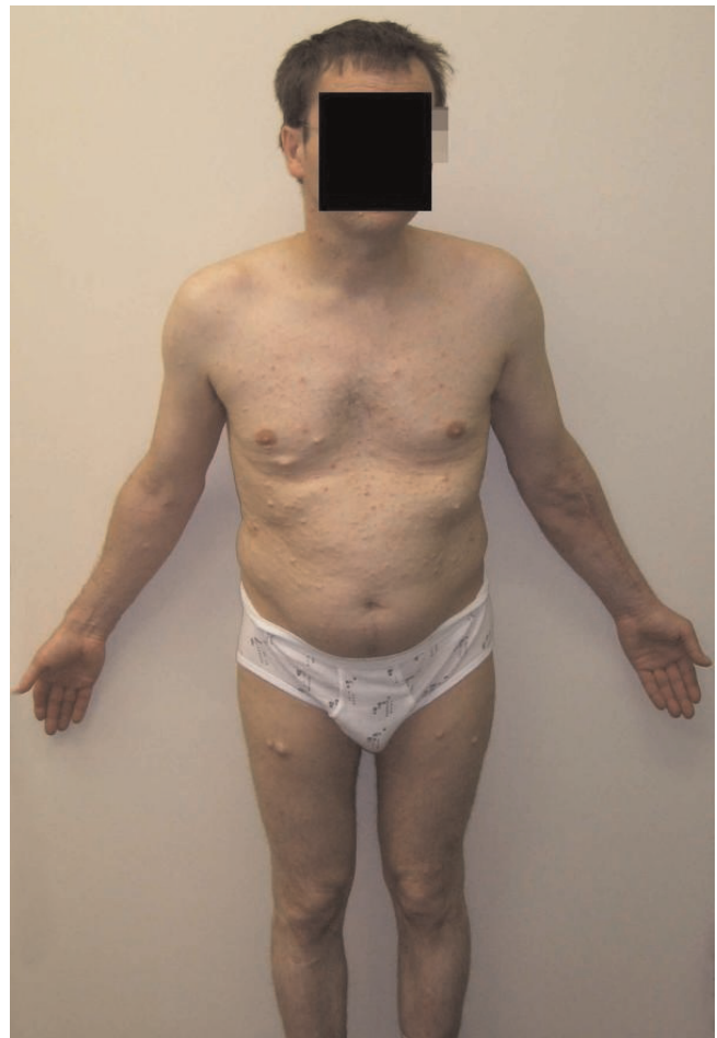
Figure 3. Generalized neurofibromatosis. Note the scar on the left forearm after resection of the liposarcoma.

Ambulant, adjuvant radiotherapy commenced 6 weeks later. The total dose of radiotherapy was determined by normal tissue tolerance. External-beam radiotherapy (1.8Gy/day, 5 days/week) was given to the left forearm region and to the supraclavicular region with a total dosage of 59.4Gy. To protect the brachial plexus, the total dosage for the left axillary region was reduced to 50.4Gy.