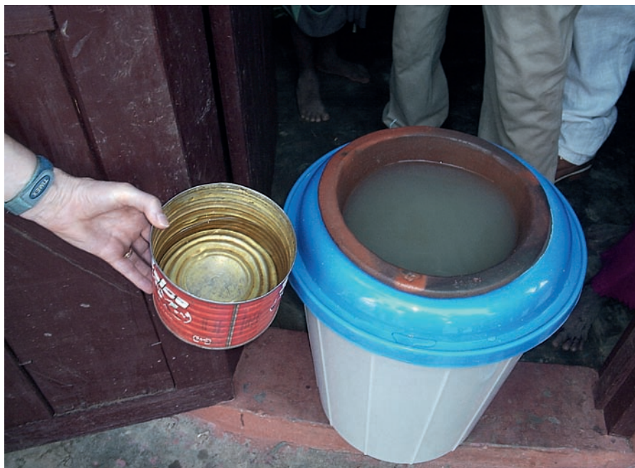
Fig 2 | The Kosim system. This consists of a ceramic pot filter that removes soil debris and microbiological contaminants from the water. The appearance of water from an earthen basin located in the Gonja District (Northern Ghana) is shown before (right) and after (left) the Kosim sanitation step.

One solution to the problem of water scarcity and pollution has therefore been the application of household water treatment and safe storage (HWTS) systems, which are a cluster of innovative, low-cost technologies developed by Murcott and her colleagues in non-governmental organizations: the Environment and Public Health Organization (ENPHO; New Baneshwor, Nepal), and the Centre for Affordable Water and Sanitation Technology (CAWST; Calgary, Canada). HWTS systems are simple, self-reliant and user-friendly, and can be used locally, such as the Kanchan arsenic filter (KAF) that is being used in Nepal, where arsenic and microbial contamination of drinking water pose a serious health problem. Murcott reported that the KAF reduces arsenic contamination by 85–90% and total coliform contamination by 85–99%; 7,000 of the 30,000–40,000 households identified as being affected by arsenic contamination are now using KAFs, and another 5,000 will install the system in the next year. This cheap household system is also being used in other countries around the world.