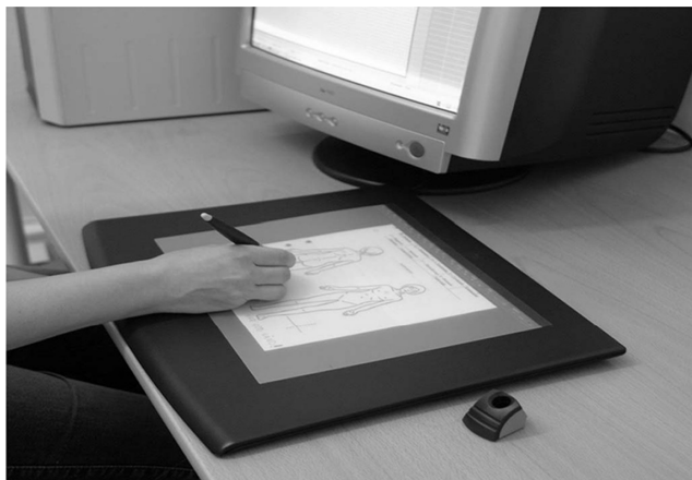
Figure 2 Computerized equipment.

Life satisfaction at follow-up was assessed using the LiSat-11 questionnaire which comprises 11 items. 24 One item addresses life as a whole while the other 10 items address vocation, economy, leisure, contacts, sexual life, activity of daily living (ADL), family life, partner, somatic health, and psychological health. Levels of satisfaction are estimated on a six-grade scale (from 1 = very dissatisfied to 6 = very satisfied) with higher scores indicating higher levels of life satisfaction. A total score can be calculated (range: 0–66).