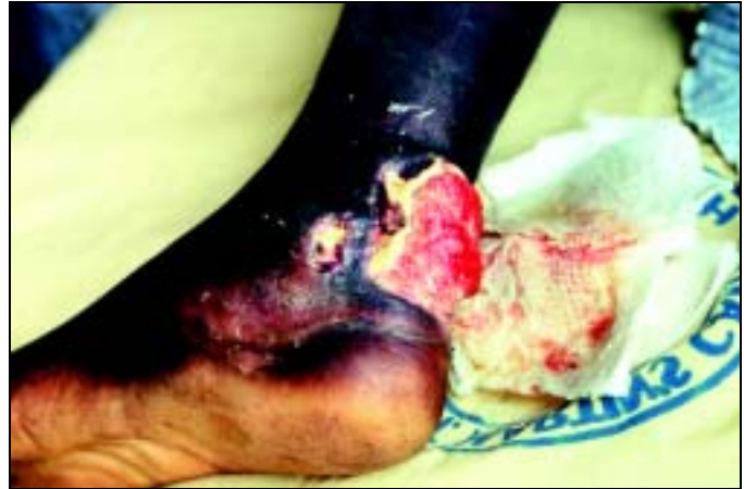
Figure 1. Buruli ulcer on left ankle.

Among patients with active lesions, age is significantly associated with sex. There are significantly more females than males among patients \geq 20 years than those < 20 years old (chi square = 14.9; p=0.0001 ; odds ratio [OR]=1.3; 95% confidence interval [CI] 1.13-1.48). The age-specific odds ratio for male likelihood of having an active Buruli lesion is 0.58 (CI 0.5-0.68; p=0 ) while that for females is 0.73 (CI 0.62-0.68; p=0.0002 ).