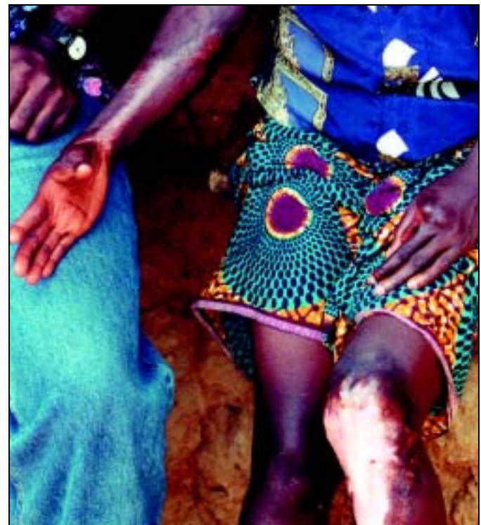
Figure 2. Healed Buruli lesions with scarring, right forearm and left knee.

Of 5,772 lesions for which the information was available, 25.1% were located on the arms and hands, 65.6% on the legs and feet, 5.4% on the trunk, and 3.8% on the head and neck. The distribution of lesions on the limbs (upper or lower limbs) is significantly associated with the age of the patient. Patients > 20 years of age have more lesions on the limbs than the younger ones (chi square=16.4; p=0.0001 ; OR= 1.43; 95% CI 1.20-1.72).