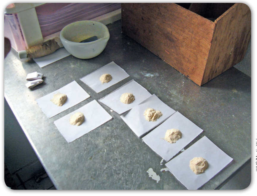
Piles of puyers , cocktails of medicines ground up into powder.

For Dr Sri Suryawati, a leading proponent of rational drug use in Indonesia, where she runs the International Network for Rational Use of Drugs (INRUD), polypharmacy - the prescription of many drugs at one time - is one of the biggest risks associated with the use of puyers , notably where there are adverse drug-to-drug interactions. Meanwhile, where side-effects occur, the fact that the drugs have been taken together makes it difficult to pinpoint which medicine is causing the problem. Other concerns include the likelihood of human error in mixing, contamination and lack of information for the consumer. "Puyer packets have no information on them," says Suryawati, pointing out that this means that puyers are not in compliance with a 1992 law on complete and accurate labelling.