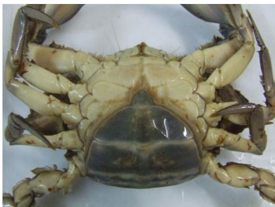
Figure 4 Abdomen of the siri adult female ( Callinectes sp.). (Photo: Pollyana Dias, 2007).

There have been very few published works elaborating emic identification keys, as for example that of Mourão and Montenegro [6] for fish at the MRE, in Paraíba State, Brazil. The confection of an emic identification key repre-