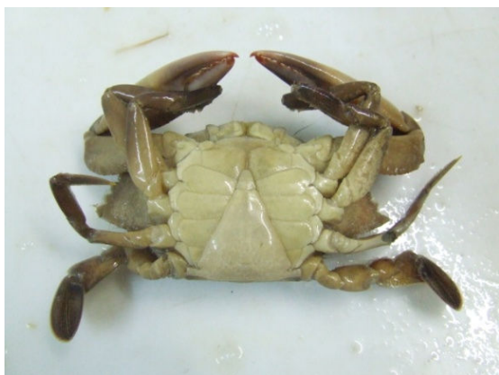
Figure 3 "Siri donzela"/ Callinectes sp. (Photo: Pollyana Dias, 2007).

observed differential denominations for young fishes and shrimps.