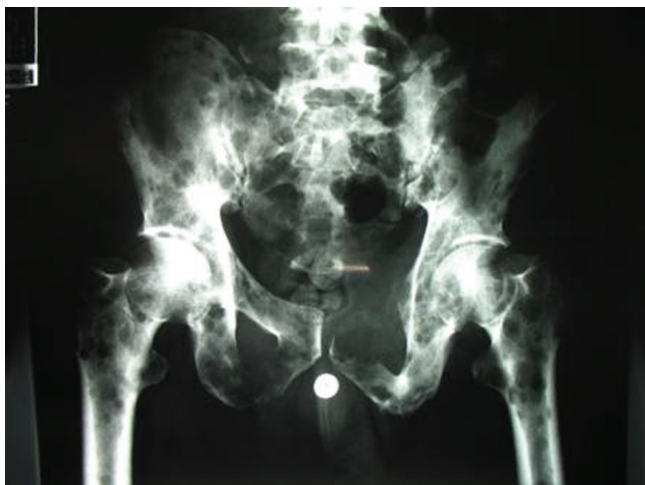
Figure 3. Plain radiograph of the pelvis and proximal femora showing extensive lytic lesions.

results, classically, in 'punched out' lytic lesions on radiography [2].