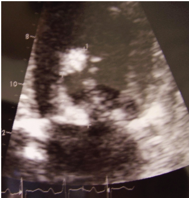
Figure 1. Pre-operative transthoracic echocardiography showing mitral vegetation and mitral chordal rupture.

On initial admission to the surgical intensive care unit, his hemodynamic status was stable with blood pressure at 130/60 mmHg with epinephrine 0.8 mg/hour and dobutamine 12 µg/kg/minute. Weaning from the mechanical ventilation was successful at the 6th postoperative hour.