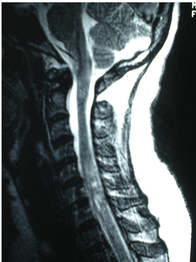
Figure 1. Sagittal T2-weighted image of the cervical spine showing an intramedullary lesion at the C5-C7 spinal vertebrae level.

A 42-year-old Malay woman was referred to us for the surgical management of an intramedullary tumor of the spinal cord in July 2002. Her symptoms started in April 2002 as subacute onset progressive quadriparesis and by the time of admission, she had developed urinary incontinence and had become bedridden. A magnetic