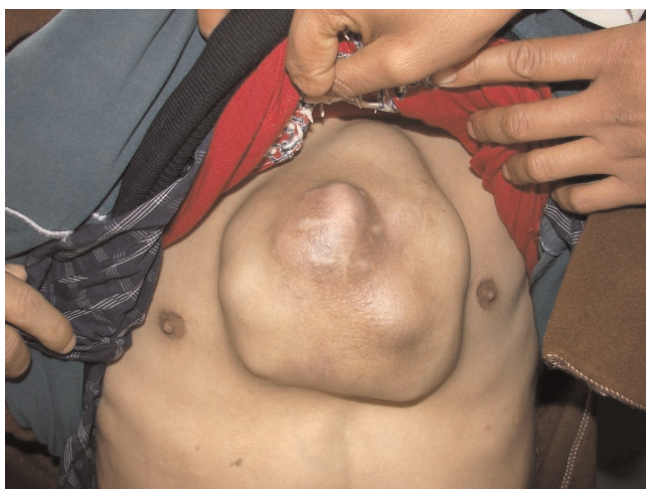
Figure 1. A midline anterior chest wall mass.

were within normal ranges. A biopsy of the mass was performed and histopathological examination confirmed the diagnosis of metastatic TPRCC.