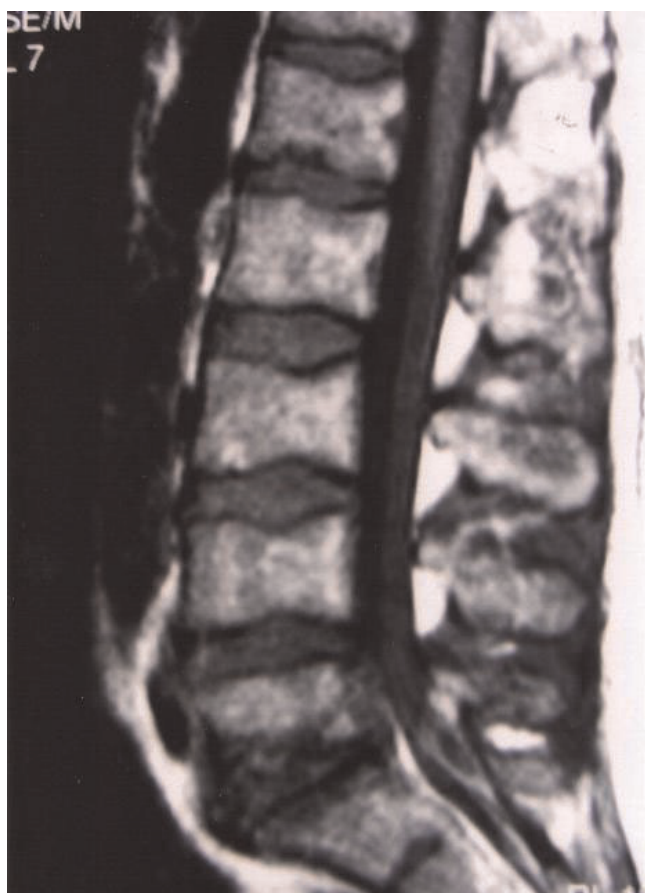
Figure 1. A sagittal pre-contrast T1-weighted spin-echo (SE) image shows a fluid collection in the posterior epidural space with low signal intensity, that is anteriorly compressing the dorsal sac and decreased signal intensity of the L5 and S1 vertebral bodies.