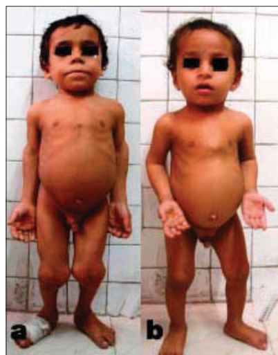
Figure 1: Clinical photograph of both male siblings (a- 8 year old, b- 2 year old) reveals rhizomelic shortening, genu valgum, exaggerated lordosis, and normal facies

The younger child was 83 cm tall (50th percentile of age is 84.10 cm) with an upper segment length of 50 cm (normal mean for age is 51.3 cm) and leg length of 33 cm (mean for age is 34 cm) 4 and an exaggerated lumbar