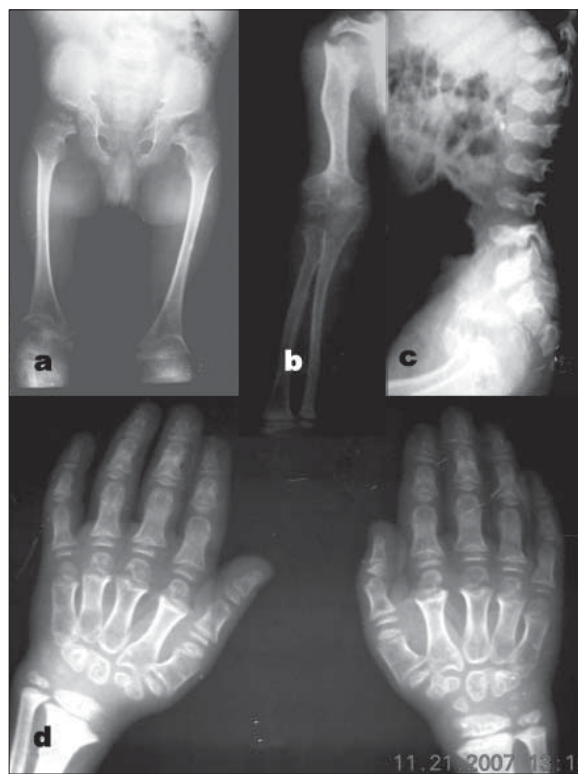
Figure 2: 8 year old (elder) sibling. (a) Radiograph (anteroposterior view) of pelvis reveals squared ilium, narrow sacrosiatic notches, dysplastic acetabuli, and a characteristic medial beak at femoral neck. (b) Radiograph (anteroposterior view) of upper limb showing markedly flared and irregular metaphysis with deformed, irregular, and fragmented epiphyses. (c) Lateral radiograph of Lumbosacral spine showing platyspondyly with central beaking. (d) Radiograph (anteroposterior view) of hand shows underdeveloped carpals with short and broad metacarpals and phalanges.

In the younger child, the pelvic radiograph revealed squared iliac wings with dysplastic acetabuli and underdeveloped