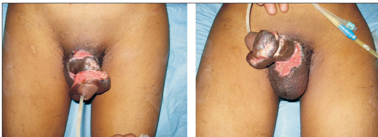
Figure 3: Post Release Incision Raw Areas