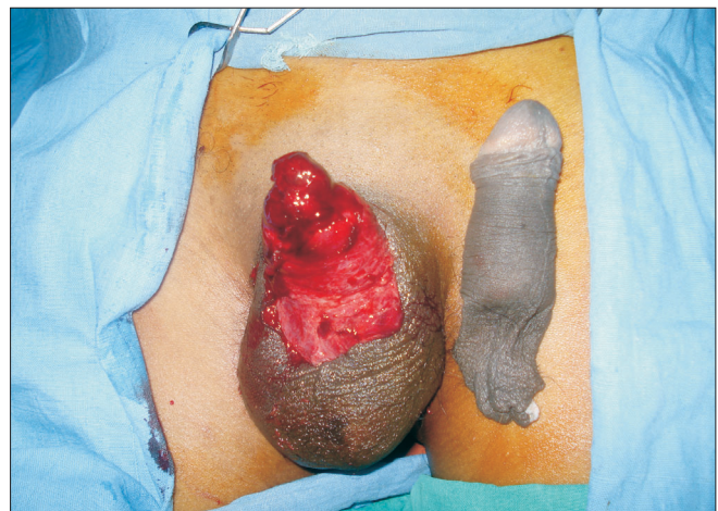
Figure 1: Total Amputation Of Penis

penis [Figure 1] that was successfully reattached by using the microsurgical technique. In March 2007, a 22 year-old married male patient having three children presented to