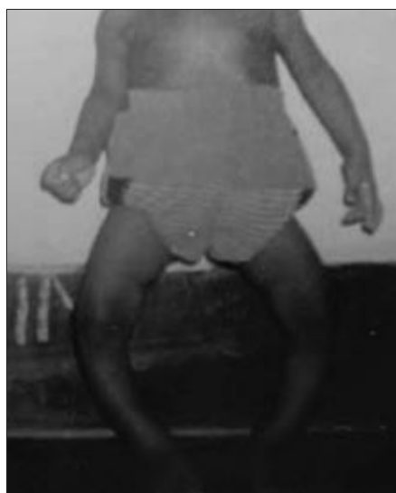
SU (3 years old)