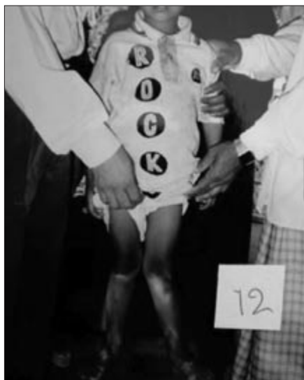
TA (3 years old)