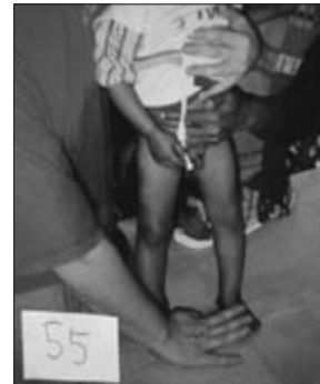
JU (3 years old)