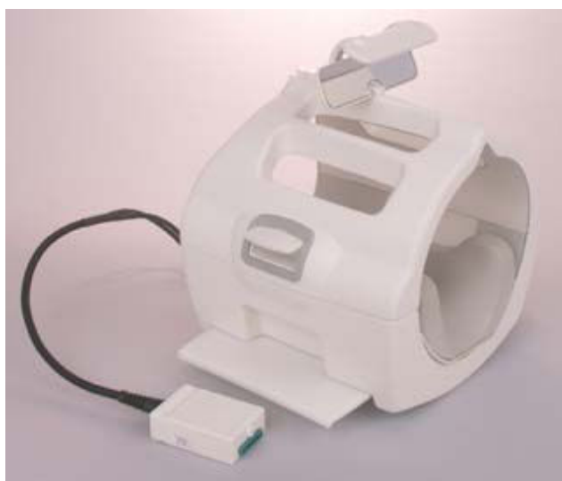
Figure 1 GE Medical Systems 1.5 Split Head Coil Mount.

then converted in TIFFs for importation into ImageJ software (ImageJ 1.33 u National Institutes of Health, USA) for evaluation. The images were thresholded to interactively set lower and upper threshold values between 40 and 255. Figure 3 is representative of the image produced by this step of ImageJ analysis. Then the threshold image