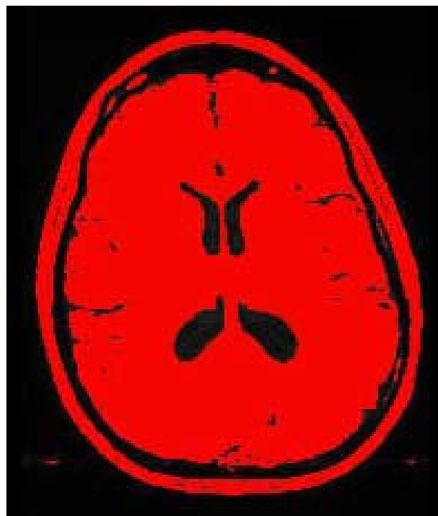
Figure 3 Threshold image.