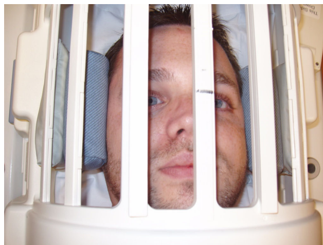
Figure 2 Head mount with human subject in place.

Two dimensional MRI scans, 23 centimeters high and 23 centimeters wide were obtained. Each 2D MRI image contains an array of 256 pixels wide by 256 pixels high. Thus, the image resolution in this case is 0.0898 cm/pixel (23 cm divided by 256 pixels and converted to mm is 0.898 mm/pixel). The images were saved in DICOM format and