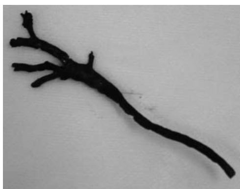
Figure 2 Biliary cast replicating the extrahepatic ductal system including the cystic duct stump.