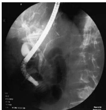
Figure 1 ERCP image revealing the dilated biliary tract with a tubular filling defect in the common bile duct until the junction of right and left hepatic ducts.