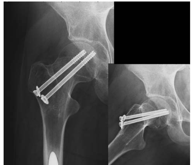
Fig. 4 X-rays showing that the fracture had healed at one year of follow up

Neoadjuvant and adjuvant chemotherapy caused a revolution in the treatment of musculoskeletal sarcoma, increasing the percentage of treatment success. The most popular treatment protocol is based on the administration of four