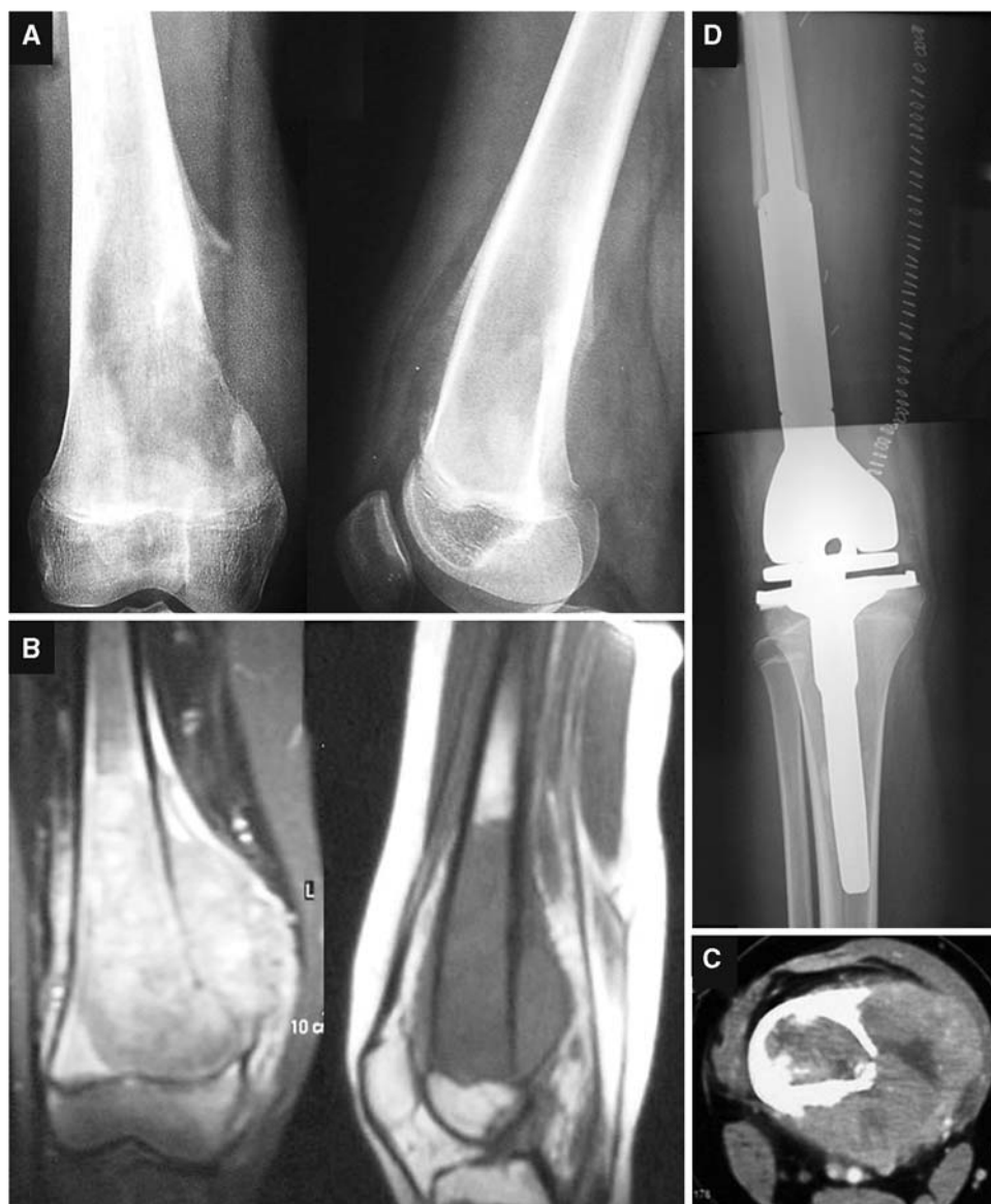
Fig. 1 a–c Preoperative images showing a mass in the medial aspect of the distal femur. d Postoperative X-rays showing the prosthesis at the site

and hypointense on T1-weighted images. It extended throughout the whole distal femur eroding medial cortex and periosteum without exceeding the epiphyseal plate; this condition was confirmed by TC (Fig. 1c). Bone scans revealed intense local uptake and no bone metastasis; this condition was also evident in total-body TC.