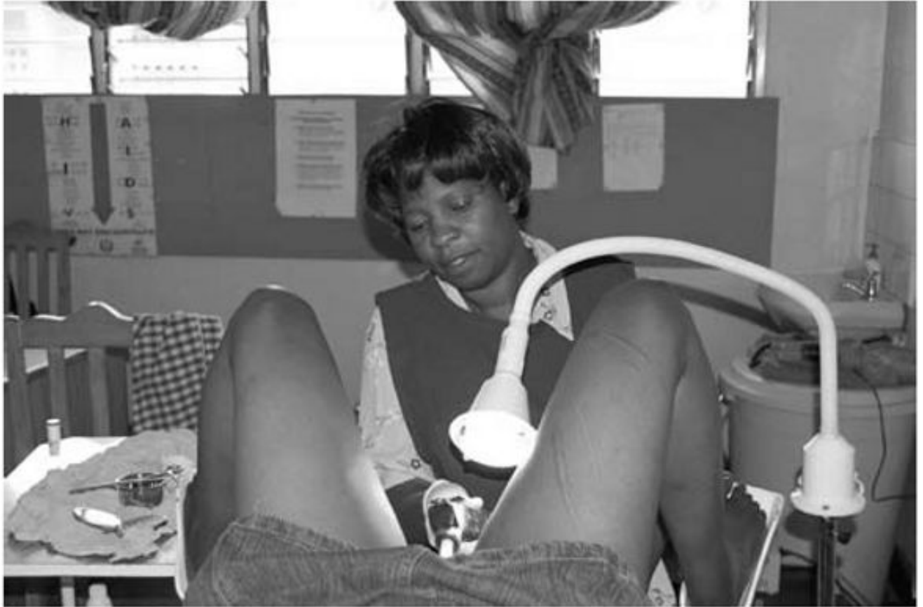
Fig. 2. Nurse performing cryotherapy