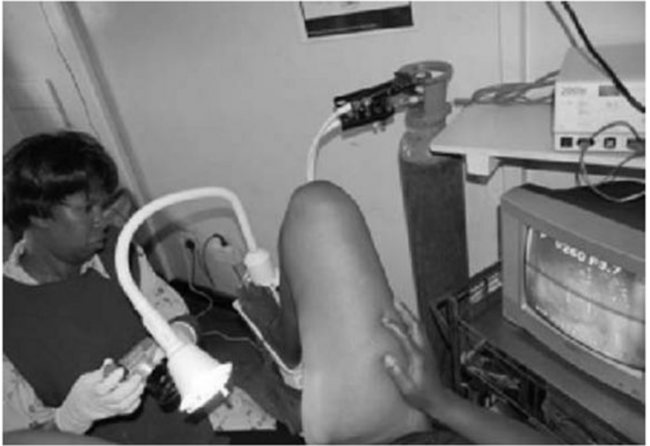
Fig. 1. Nurse performing visual inspection with acetic acid (VIA) with simultaneous digital cervicography