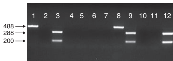
Fig. 1 Ethidium bromide stained agarose gel image following random mutation capture analysis. Lanes 1 and 8: full length band following two rounds of digestion, this band would be excised and gel extracted for sequencing as it is presumed mutant. Lanes 3 and 9: PCR product which has cut during the second round of digestion with Taq1 \alpha . This represents a molecule which has not been digested during the first restriction digest and so has amplified during PCR. This shows the second round of digestion to be necessary so as to identify only true mutants, and avoid unnecessary sequencing. Lane 12: Control DNA from this subject which did not undergo digestion prior to PCR, but does digest after PCR, which shows that this subject does not have a polymorphic variant in the restriction site.