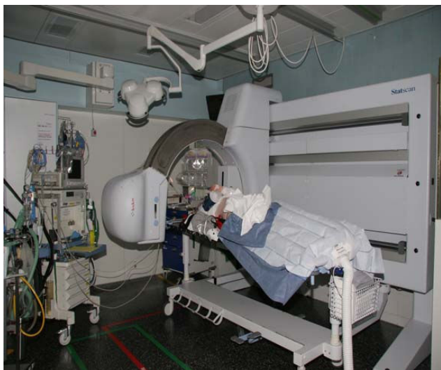
Figure 1 Lodox Statscan device in Inselspital ED.

LS has also emerged as a useful diagnostic tool in other areas of medicine: recent publications have reported on the effective use of the device in pediatric trauma, pediatrics, neurosurgery, internal medicine, and even in forensic medicine. To the best of our knowledge, this is the only FDA-approved device of its kind currently used in emergency departments. A new full body low dosage 2D/3D scanner (EOS http://www.biospacemed.com ) has been recently introduced to the international market, but does not seem to be applicable in injured patients.