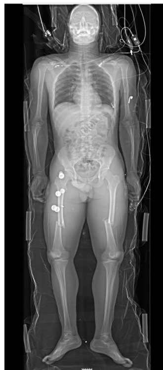
Figure 2 Whole-body scan of a trauma patient with bilateral femur fractures.

In a clinical trial with the LS, Boffard et al compared its effectiveness in detecting injuries with the standard ATLS X-ray protocol [8]. Compared to conventional a.p. radiographs, the authors reported no loss of information for the chest and pelvis, cervical spine, the cervicothoracic junction, or for long bones (Fig. 2). A study by Beningfield