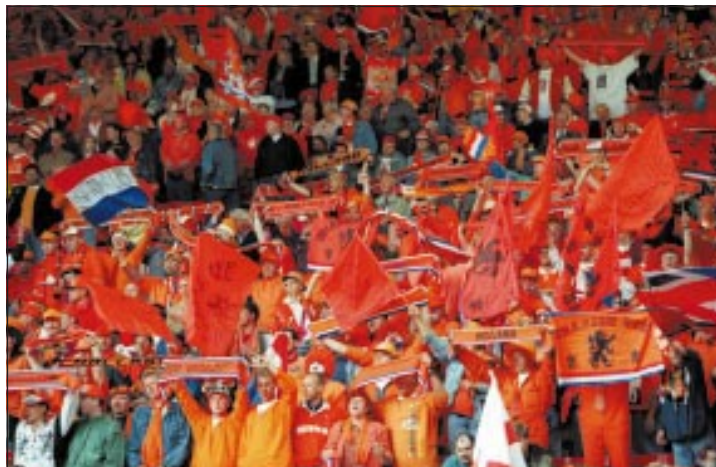
Was it the excitement, or was it the final score? The Netherlands-France match triggered excess cardiovascular events in Dutchmen—but not in women

The figure shows the number of deaths from all causes and myocardial infarction or stroke during 17-27 June 1996 for men and women separately. Mortality from all causes was increased in men on 22 June (173 v 150.1 cases; relative risk 1.15, 95% confidence interval 0.98 to 1.35) and lower in women (146 v 164.1 cases; relative risk 0.89, 0.75 to 1.06). In men, mortality from myocardial infarction or stroke was significantly increased (relative risk 1.51, 1.08 to 2.09) on the day of the football match (41 cases) compared with the five days on either side (on average 27.2 cases). Mortality from myocardial infarction and stroke in men was lowest