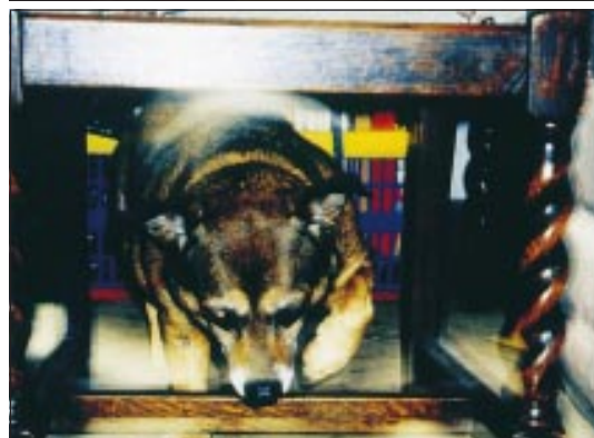
Fig 1 Canine hypoglycaemia alarm (Candy): (top) alert mode; (bottom) activated