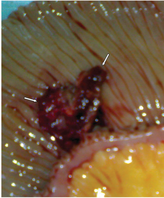
Figure 4 The resected jejunal loop showing the ulceronodular growth due to metastatic choriocarcinoma (arrows).