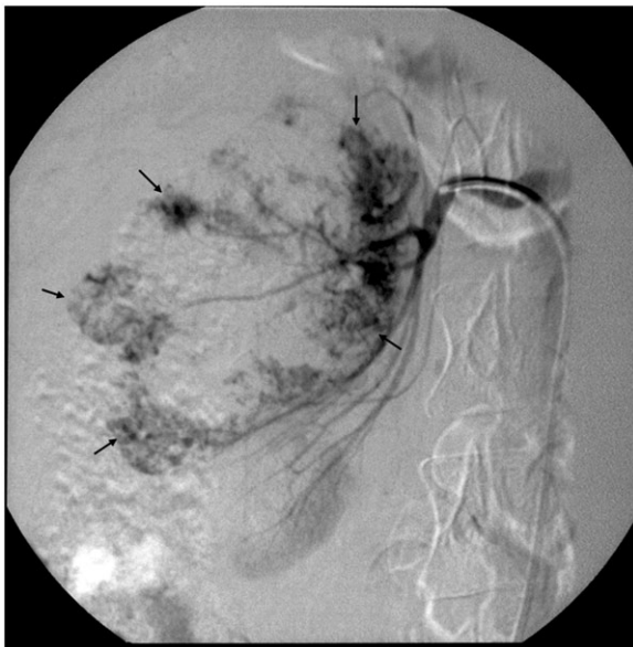
Figure 2 Angiography of the right kidney showing multiple microaneurysms (arrows) and areas of contrast puddling.

however, the patient continued to have episodic massive hematuria. A decision to undertake angioembolization of the renal masses was taken and angiography (DSA) was performed, which revealed a large hypervascular right renal mass with multiple small pseudoaneurysms and areas of contrast puddling within the renal mass (Fig. 2). Selective left renal angiogram also showed a focal hypervascular mass in the interpolar region with similar findings (Fig. 3). Selective embolization of