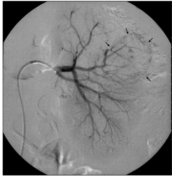
Figure 3 Angiography of the left kidney showing microaneurysms in the tumor-bearing segment (arrows).