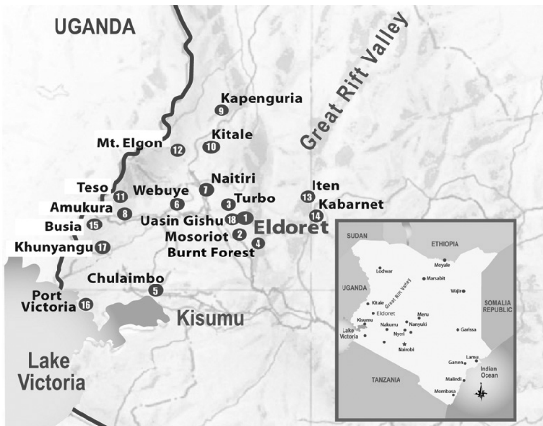
Figure 1 Map of USAID-AMPATH Partnership sites.

Kosirai Division is parcelled into nine smaller administrative areas, called locations, that in turn are divided into 24 sub-locations. The average sub-location is 4 km in diameter and thus can be crossed easily on foot (one to two hours). As part of our clinical trial, eight sub-locations were randomly assigned to the CCC intervention, and the remaining 16 were assigned to control status.