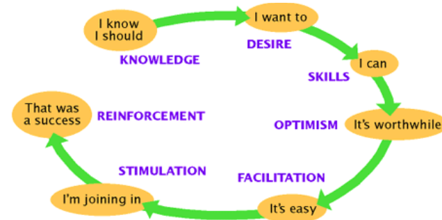
Figure 2 Sequential model of behavioral and social change.

The next step, facilitation , helps convince the audience that it is feasible, even easy, to adopt the new behavior. Social modeling is one mechanism for achieving this goal [35,36]. Social models are individuals similar to the audience who model successful execution of the new behavior. When individuals view those who are similar executing a behavior, it enhances their self-efficacy (i.e., confidence) for performing that behavior themselves. And high self-efficacy increases the likelihood that the target individuals also will execute the behavior [35,36]. Thus, for example, meeting peers who have successfully completed depres-