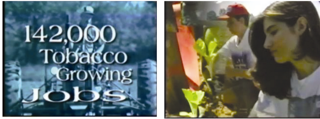
Figure 8. Tobacco: Working for America. Brown and Williamson, 1996.