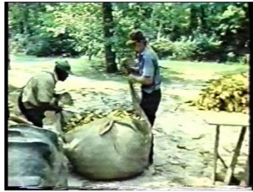
Figure 2. Leaf. Tobacco Institute, 1974.