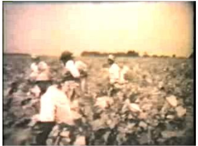
Figure 1. A Plant for Tomorrow . Lorillard Tobacco Company, 1956. Editor suggested we reduce text in captions. Format follows standard of Visual Anthropology Review.