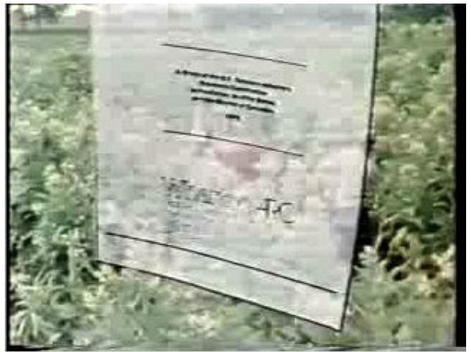
Figure 5. Tobacco Speaks Out. Tobacco Institute, 1983.