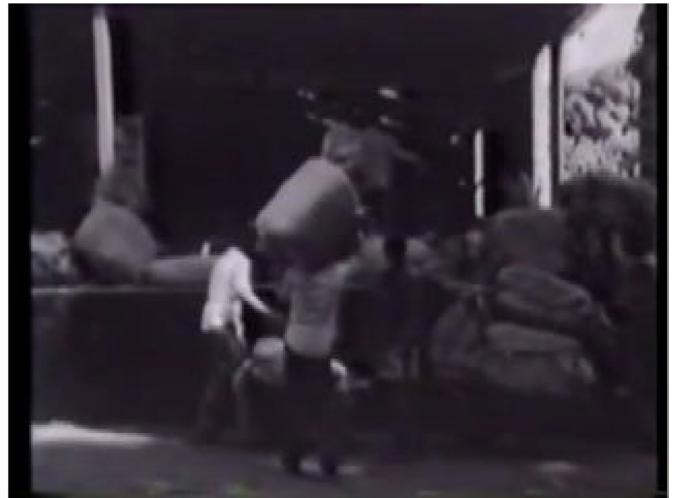
Figure 6. BAT in the Developing World [Kenya]. British American Tobacco, 1988.