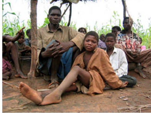
Figure 9. Images of the social, economic, and environmental consequences of tobacco farming in Malawi and other developing countries are strong counter messages to imagery in tobacco industry-produced videos about the benefits of tobacco farming.