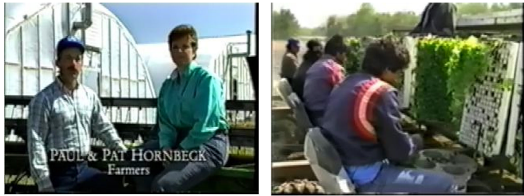
Figure 7. Real Lives . Philip Morris, 1993.