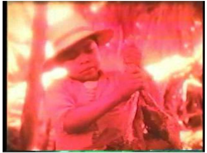
Figure 3. Gringo Amigo . Verband der Cigarettenindustrie, 1979.