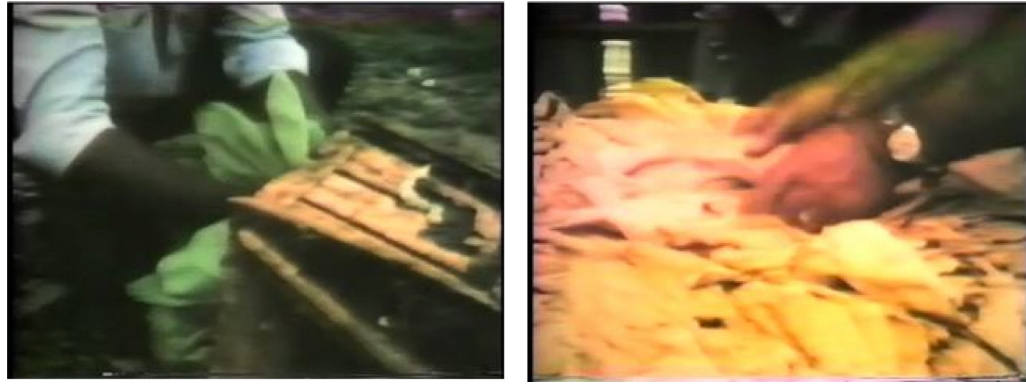
Figure 4. Tobacco: Seed to Pack. Philip Morris, 1979.