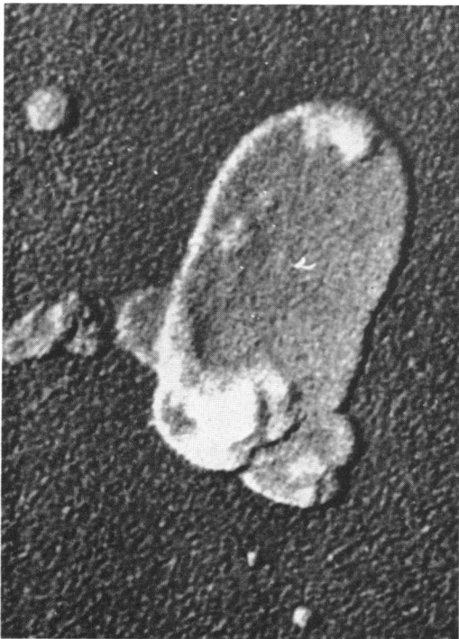
FIG. 1. Rickettsia mooseri cell wall, fixed in osmic acid and shadowed with chromium. \times 62,100 .

for maximal cell wall yield were constant from experiment to experiment, and resulted in structures whose morphology did not vary greatly.