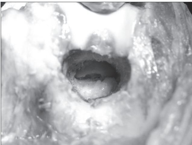
Fig. 2. Anterior capsular release and coronoid excision were carried out through the hole.