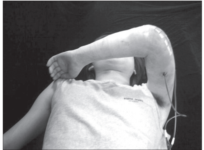
Fig. 4. Passive extension motion and early overhead down exercise for flexion began one day after surgery.