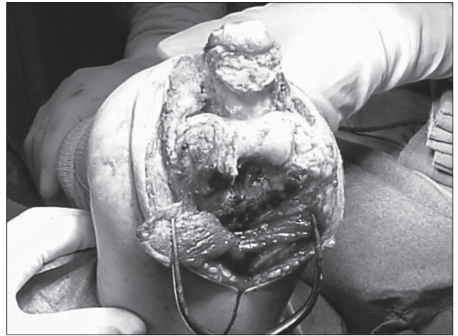
Fig. 3. The collateral ligament was released in a patient with elbow flexion limitation.