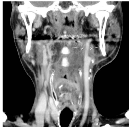
Fig. 3. A computed tomography scan performed after 3 cycles of chemotherapy showed a considerable reduction of the mass which compresses the left internal carotid artery.

30 seconds and headache. Syncope was heralded by a sensation of lightheadedness.