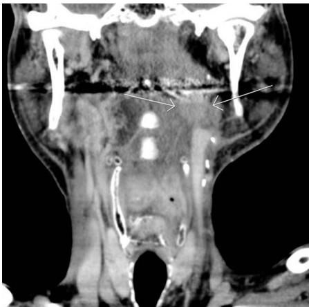
Fig. 2. A computed tomography scan revealed ovoid mass lesion compressing the left internal carotid artery.