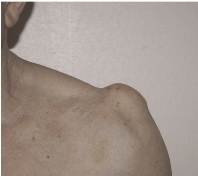
Figure 1. Preoperative image of the fistulized acromioclavicular joint cyst.

Plain X-ray examination of the left shoulder showed ACJ degeneration, with acromioclavicular (AC) space narrowing and osteophyte formation, proximal migration of the humeral head and osteoarthritis of the gleno-humeral joint (Figure 2). Further MRI evaluation confirmed the clinical diagnosis of a complete rotator cuff tear and observed a large, well-defined subcutaneous cyst in communication with the degenerative ACJ (Figure 3). Culture of the synovial-like fluid was negative and white