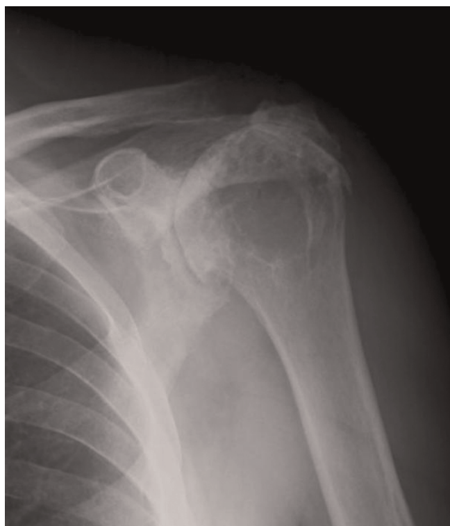
Figure 4. Postoperative shoulder X-ray.

blood cell count, erythrocyte sedimentation rate and reactive C-protein were within normal limits.