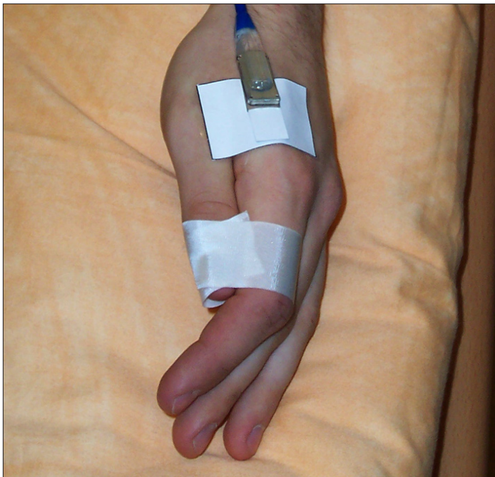
Figure 1. Positioning of the micro-lightguide spectrophotometry probe LF 2 (LEA Medizintechnik, Giessen, Germany) for the measurement of laser Doppler flux and tissue oxygenation at the thenar eminence of the hand.