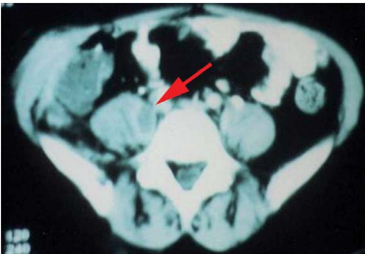
Figure 7: Psoas abscess on the right, computed tomography scan, August 2001

tissue abscesses are not typical of CRMO. The rapid therapeutic success of anti-inflammatory treatment with high-dose corticosteroids and indomethacin seemed to confirm the misdiagnosis of CRMO, but in reality it masked the tuberculous inflammatory processes only temporarily. It is possible that the use of steroids further activated the tuberculosis (abdominal abscess), which then led to the diagnosis.