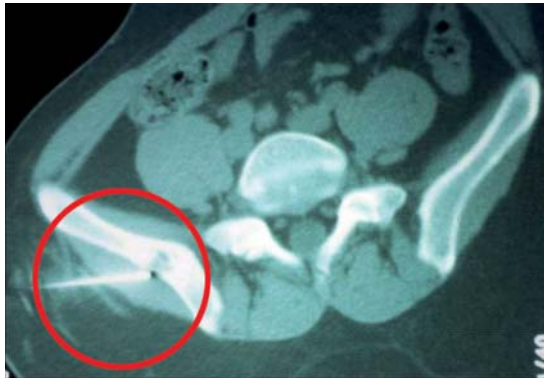
Figure 1: Computed tomography–guided puncture of osteolytic lesion on the right iliac crest, October 2000

was experiencing severe pain in his lumbar spine, pelvis, and cervical spine and was physically extremely weak. He was afebrile and no lymphomas were found, but abscesses had developed at the puncture site on the patient’s right iliac crest and forehead. Abdominal sonography showed hepatosplenomegaly and a pleural effusion on the left. Radiological investigations showed multiple osteolytic lesions with soft tissue involvement.