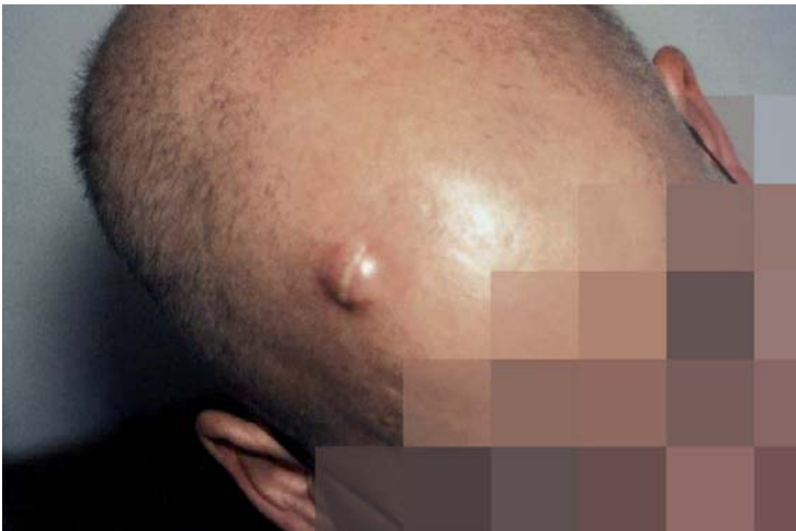
Figure 6: Recurring inflammatory focus on the head in the region of a scar from earlier biopsy, July 2001