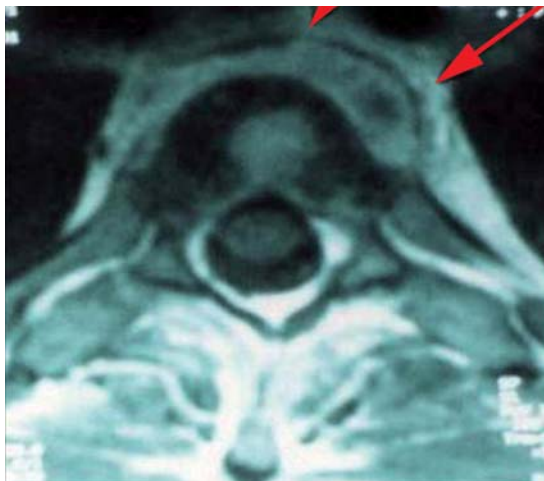
Figure 2: Paravertebral thickening of soft tissue, computed tomography scan, December 2000

In July 2001, the patient experienced increased bone pain, and an abscess formed in the area of an earlier osteolytic lesion on the skullcap to the right above the forehead ( Figure 6 ). A swab contained acid fast bacilli, as shown under the fluorescence microscope after auramine phenol staining, but not after Ziehl-Neelsen staining.