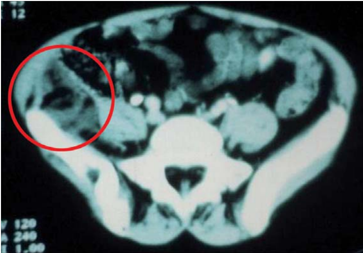
Figure 5: Abscess pocket on the right, computed tomography scan, June 2001