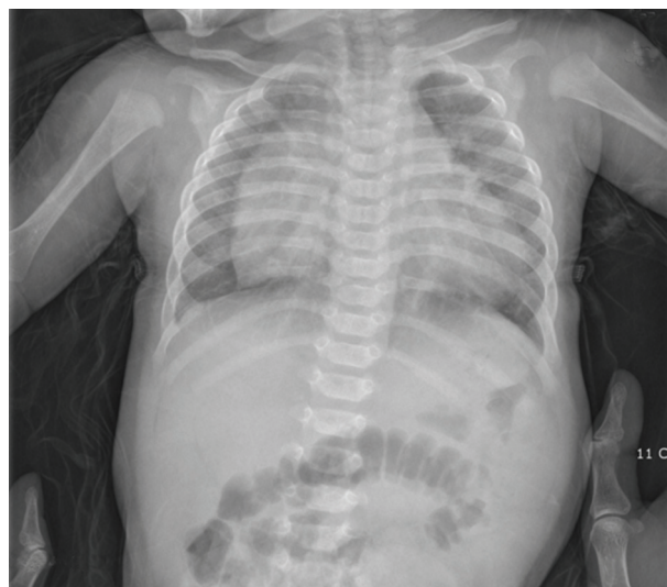
Fig. 3. Chest radiography showed improvement in cardiomegaly on follow-up after 2 months later.