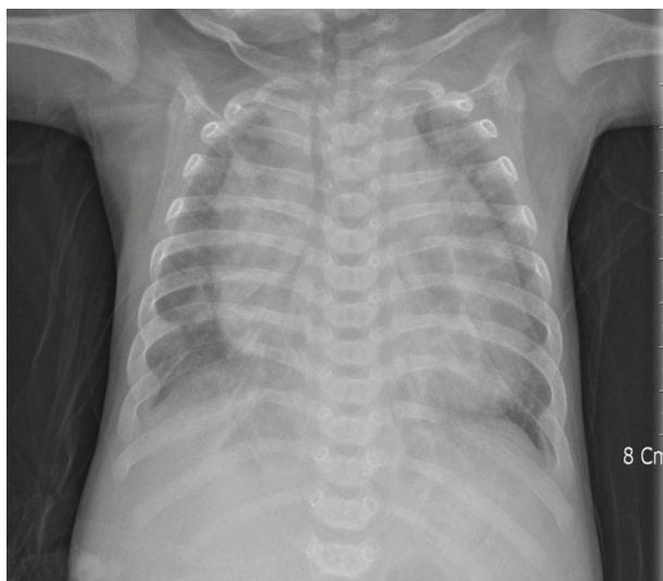
Fig. 1. Initial chest radiography showed severe cardiomegaly.