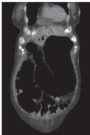
Figure 1: Saggittal section of the abdomen showing severe gastric and intestinal dilatation

HPVG is most often confused with pneumobilia viz. gas in the hepato-biliary tree. The pattern of air in HPVG has been described as that extending to within 2 cm of the liver capsule as seen in Figure 2, while the air in the biliary tract remains central around the portal hilum and does not extend to within 2 cm of the liver capsule. The gas in the biliary tree moves towards the portahepatis by the centripetal force of the bile and appears central in the liver, while that in HPVG travels peripherally caused by the centrifugal flow of blood. HPVG is commonly associated with intramural bowel gas called pneumatosis intestinalis, which may be secondary to necrotic bowel. It is characterized by thin, continuous, crescentic radiolucency within the distended bowel wall. Although the pathophysiology and mechanism of HPVG are not well understood, the factors associated with it include bowel distension with mucosal damage, sepsis, and gas embolization. [6] It is hypothesised that the gas enters the