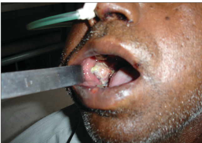
Figure 3: BFP on 5 th postoperative day showing minimal bulge in the initial period