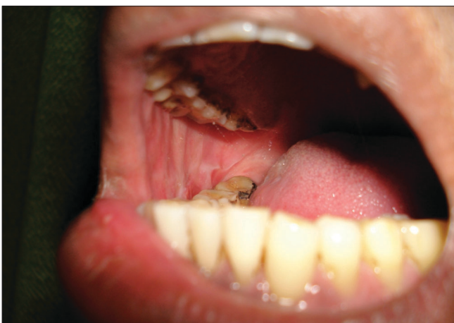
Figure 5: BFP at 3 months showing normal healing with adequate mouth opening