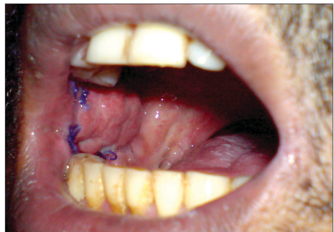
Figure 4: BFP at 1 month with epithelialization almost completed