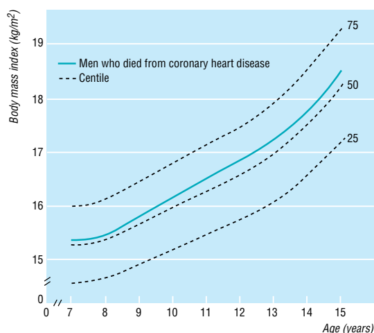
Fig 1 Body mass index during childhood in men who later died from coronary heart disease compared and centiles for body mass index of all men in cohort (n=3641)

for men with the highest ponderal index at birth and the lowest body mass index at 11 years of age was set at 1.0. The highest hazard ratio of 5.3 was in men with the lowest ponderal index at birth and the highest body mass index at 11 years of age. In a simultaneous regression, the hazard ratio for death from coronary heart disease increased by 14% (8% to 19%; P < 0.0001 ) for each unit ( \text{kg}/\text{m}^3 ) decrease in ponderal index at birth and by 22% (10% to 36%; P = 0.0001 ) for each unit ( \text{kg}/\text{m}^2 ) increase in body mass index at 11 years of age. Figure 2 further illustrates these associations, showing that boys born with a high ponderal index had a low risk of coronary heart disease, even if they became overweight in childhood, whereas the high risk of those who were thin at birth was further increased if they became even moderately overweight during childhood. The results for body