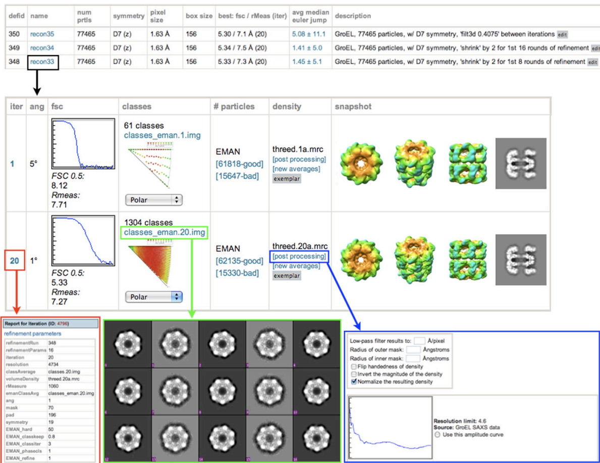
Figure 2. Reconstruction report page

Overall statistics for every reconstruction stored in the database are displayed on the reconstruction summary page. Selecting one of these reconstructions links the user to a page displaying the results of each iteration (black box). For every iteration, the parameters for that iteration are available by clicking on the iteration number (red box). Plots showing the Euler angle distribution and the FSC curve. These plots, as well as most other images and graphs displayed, are thumbnails that can be displayed at full resolution by clicking on them. Class averages can be viewed by clicking on the “classes” link (green box) and particles that were used in the reconstruction vs. those that were rejected can be viewed by clicking on the “good” and “bad” links. The user has the option to do some post-processing on the 3D maps (blue box), e.g. applying a low-pass filter, masks, flipping the handedness, normalizing, and performing an amplitude adjustment.