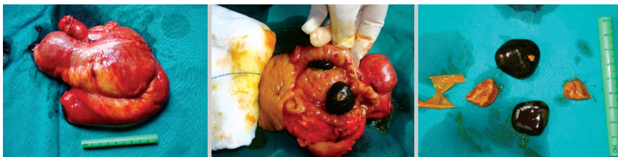
Fig. 4. Side-to-side ileoileic anastomosis. The stone's colour was black and their size was about 3 cm in diameter.