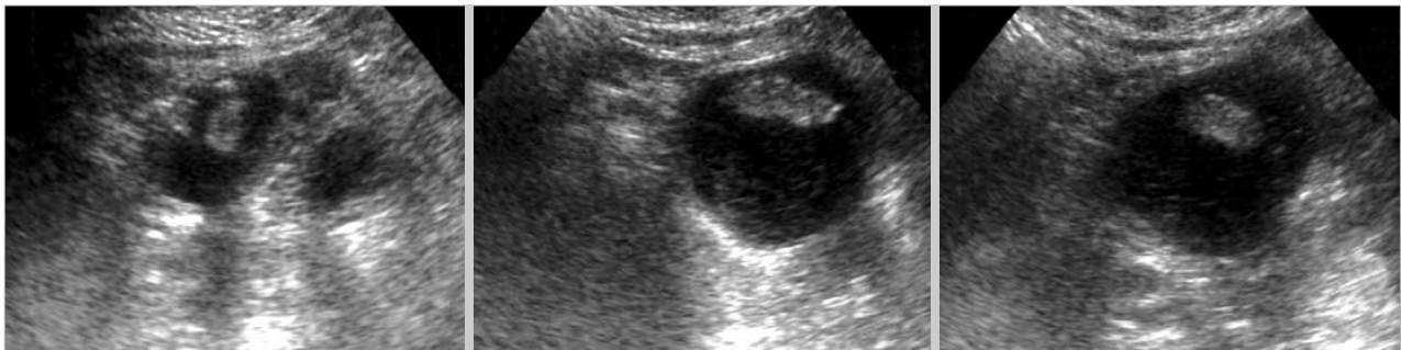
Fig. 2. Gallstones were identified within the dilated bowel as floating hyper-echoic foci producing distal acoustic shadowing reflections, which moved when the patient's position was changed.