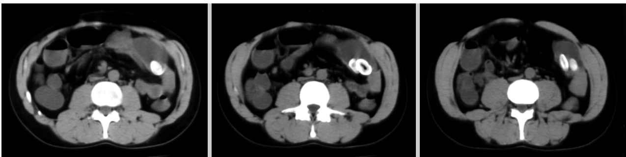
Fig. 3. CT scans showed multiple air-fluid interfaces the distended small bowel loops and two big ectopic peripheral calcified stones with radiolucent centers in the dilated small bowel.

The computed tomography (CT) showed multiple air-fluid interfaces, distended small bowel loops and two big ectopic peripheral calcified stones with radiolucent centers in the dilated small bowel of terminal ileum. One of them had a thick calcified surface and hypo-dense center which the form is like Mercedes-Benz figure. The stones had an average diameter